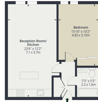
Ground Floor Floor Area 552 Sq Ft - 51.28 Sq M